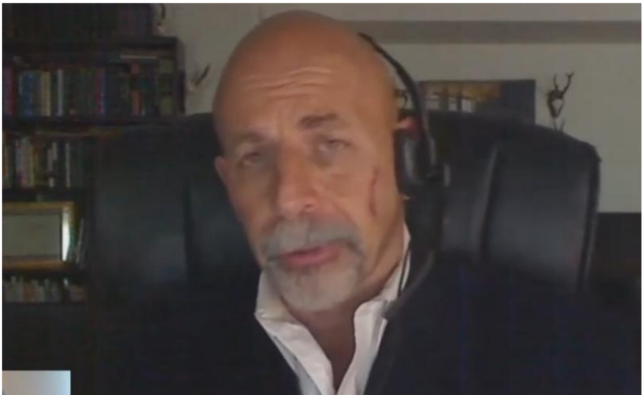
Dr. Evil Returns with Neuroweapons